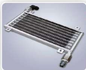
After Cooler 後部冷卻器