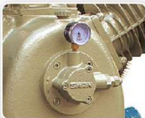
Enforced Oil Lubricating System 強制潤滑機構