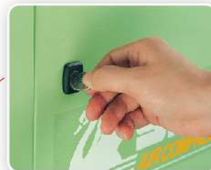
Quick Lift-off Door 快拆式板金