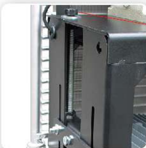
Adjustable Belt-tension Mechanism 皮帶調整器