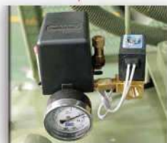
Solenoid Valve 電磁閥