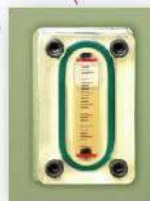
Oil Gauge 油鏡