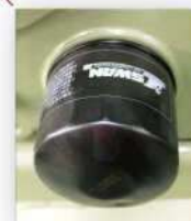
Oil Filter 油過濾器